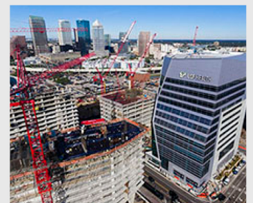
USF Health Morsani College of Medicine