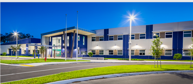
Sumner High School