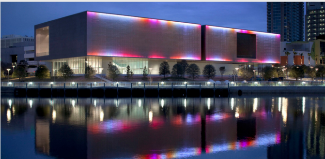
Tampa Museum of Arts