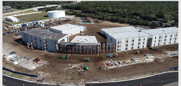
Dorothy C. York Innovation Academy